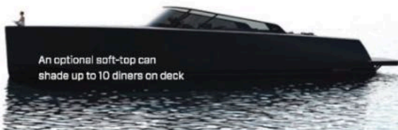
An optional soft-top can shade up to 10 diners on deck

Now under Pardo ownership, Van Dutch has a new flagship model with contemporary aesthetic by Italian designer BurdissoCapponi Yachts&Design. The 73ft boat is due to splash at the end of 2024. The standard layout comprises an open-plan kitchen with an owner's cabin and twin cabin aft and a VIP cabin forward, while a second configuration sacrifices the twin to make way for a larger owner's suite. There's an up-down swim platform and tender garage, while three IPS engines push the 75 to 40 knots.