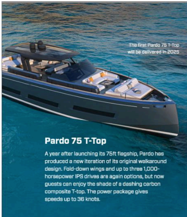
The first Pardo 75 T-Top will be delivered in 2025