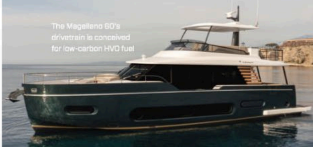
The Magellano 60's drivetrain is conceived for low-carbon HVO fuel

With her rounded bow and an abundance of outside space, this boat has been given a proud explorer look by Ken Freivokh. But the builder paid a lot of attention to the hull below the waterline, too. So-called "dual mode" design makes the boat efficient at both semi-planing pace and displacement speeds. Azimut says this equates to 20 percent lower CO 2 emissions, while the steep deadrise at the bow gives stable handling. Floor-to-ceiling windows surround the galley and social areas on the open main deck, while the full-beam owner's cabin below is also very bright. Two more big guest cabins plus a captain's cabin aft make this a flexible owner- or skipper-operated vessel.