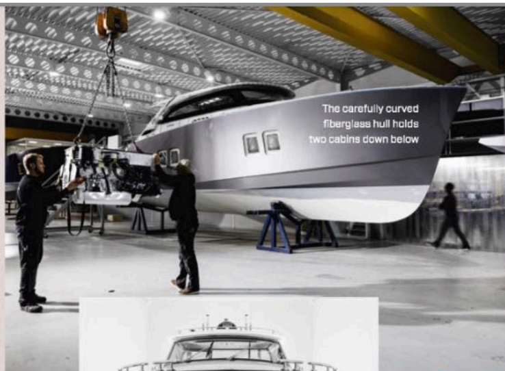
The carefully curved fiberglass hull holds two cabins down below

A year after launching its 75ft flagship, Pardo has produced a new iteration of its original walkaround design. Fold-down wings and up to three 1,000-horsepower IPS drives are again options, but now guests can enjoy the shade of a dashing carbon composite T-top. The power package gives speeds up to 36 knots.