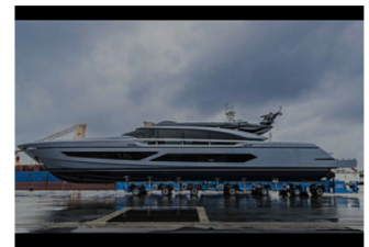
News from the seas