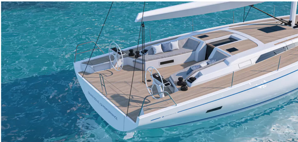
Guests can safely use the cockpit, furnished with benches with an innovative and ergonomic design.