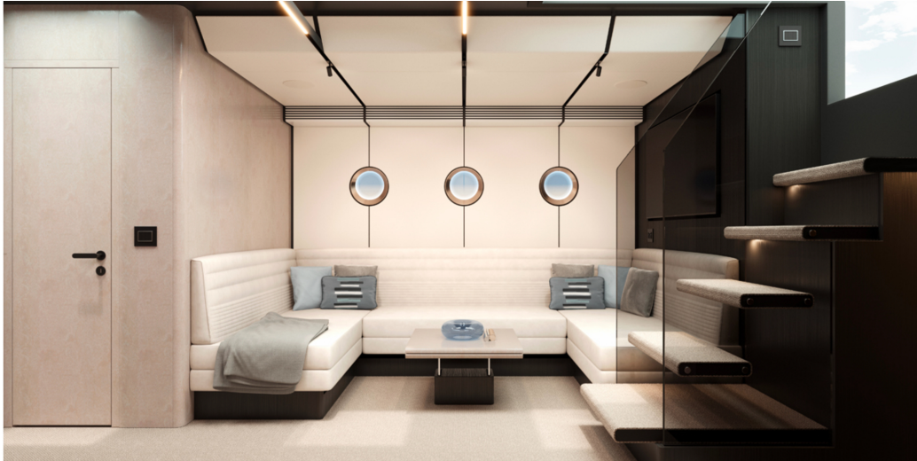
The Cool version of interiors is characterised by pearly briarwoods, and has fresh and contemporary tones.

The World Premiere of the Grand Soleil 52 Performance will be at the Cannes Yachting Festival 2024.