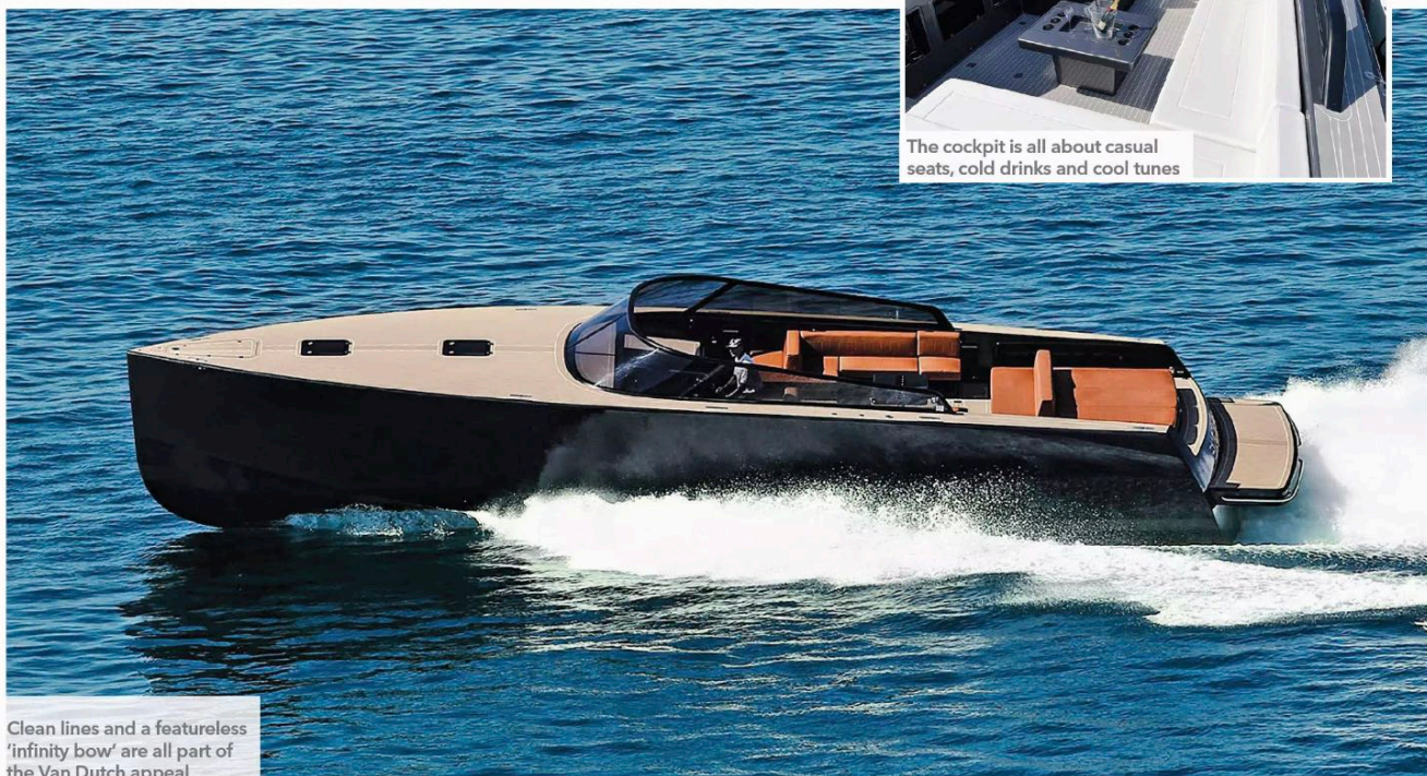
Clean lines and a featureless 'infinity bow' are all part of the Van Dutch appeal