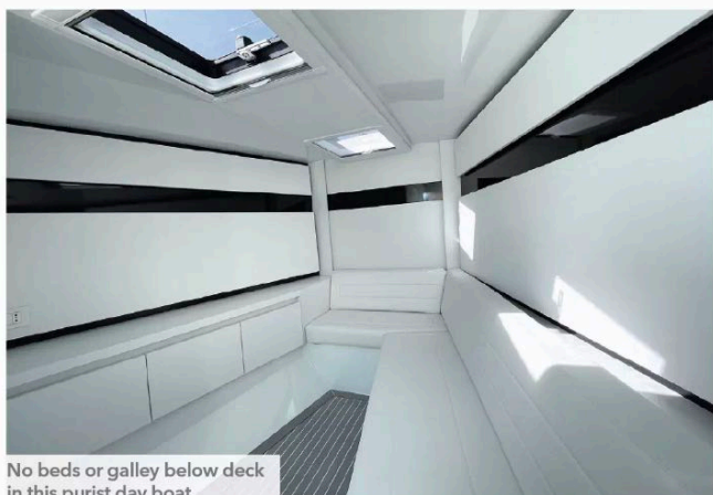
No beds or galley below deck in this purist day boat

Now clearly, the Van Dutch 40 is not for everyone. But as an engrossing diversion at the Palma Boat Show and a feel-good ambassador for the Van Dutch way of doing things, this 16-man plaything is an infectious demonstration of what zero-compromise day boating is all about.