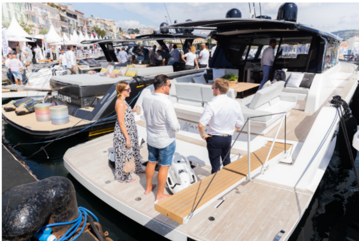
Three brand-new models launched in Cannes by Cantiere del Pardo